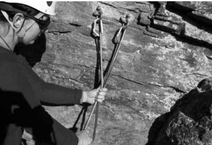
3. Pull sling down in the middle, trying to keep each arm of the sling evenly tensioned and in the direction of where the force will apply.