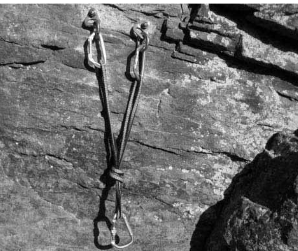
5. Attach locking biners into the focal point loop.*

* Debate and confusion arise about whether there should be one or two locking biners at the focal point. The answer is that it depends. One factor to consider is whether you are setting the top rope up for a group, or groups, where it will be there all day, or just setting it up for a friend, or friends, to top rope once or twice. Another is whether there is a chance the biner will push against rock and have the potential to open. The fact is that screwgates do undo even if the gate is facing down. Therefore, two opposing locking biners is preferable in my opinion.