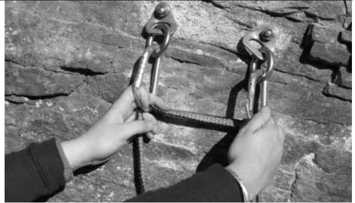
2. Create a top rope anchor: snap gate biners into anchor rings and clip sling through both biners.