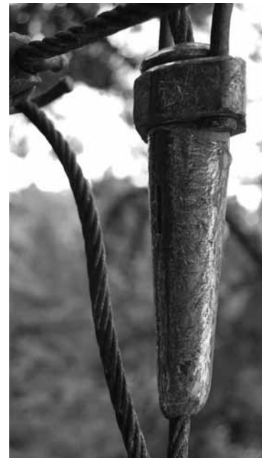
Scratched strandvice caused by rubbing against lower cable.