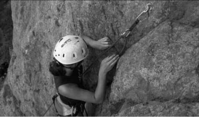
1. Clip quickdraw into one of the anchor rings