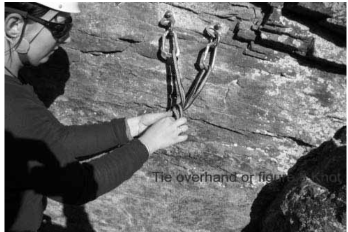
4. Tie an overhand or figure 8 knot, called the focal point.