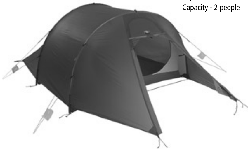
Exped Sirius II Extreme Capacity - 2 people

With each of our stores stocking over 7500 products from 150 different suppliers, we are able to offer the best performers in each category. We present cutting edge technology from leading international manufacturers such as Arc'teryx, Berghaus, Black Diamond, Exped, Osprey, Outdoor Research and The North Face. Every item has undergone a selection process during which the product has proven itself to be a top contender in its category.